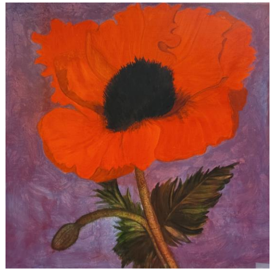
Peggy Tombro, "Poppy"