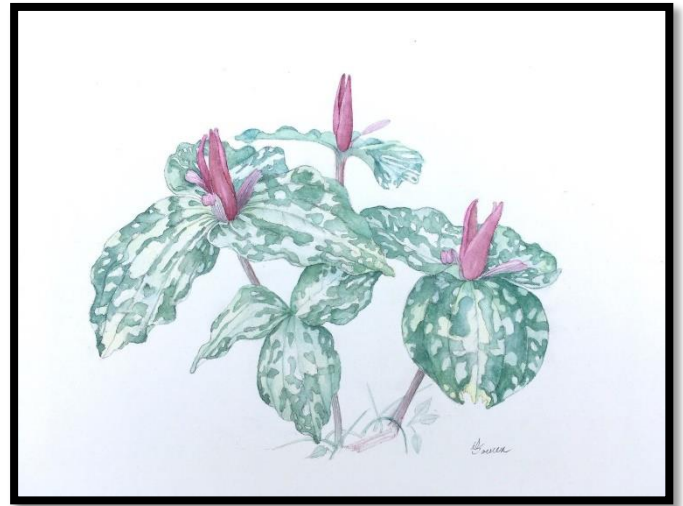
Donna Souren, "Trillium at Buck Garden"

https://www.co.somerset.nj.us/government/public-works/cultural-heritage/public-art-exhibits/senior-art-show#ad-image-0